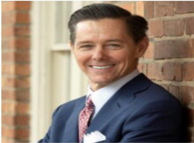
Founder & Chairman Ralph Reed